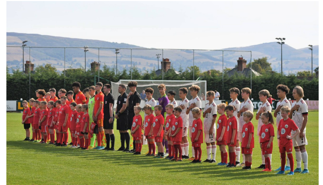
Wales U16's V Belgium U16's