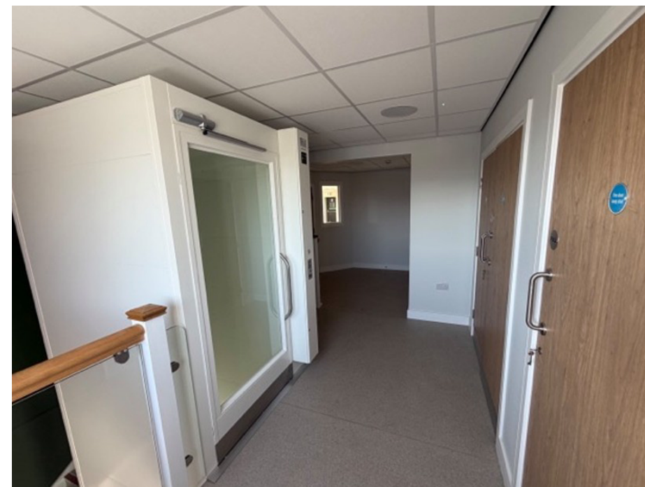
Lift for disabled access