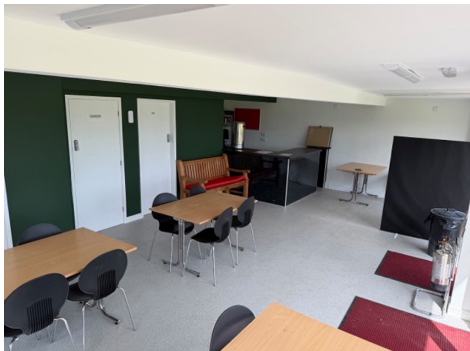
Media & Breakout Rooms