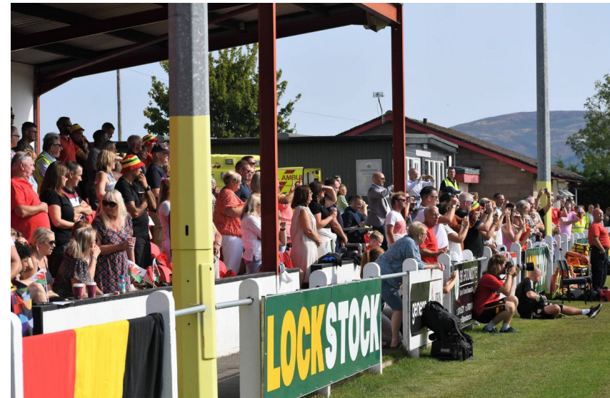
Spectators at International