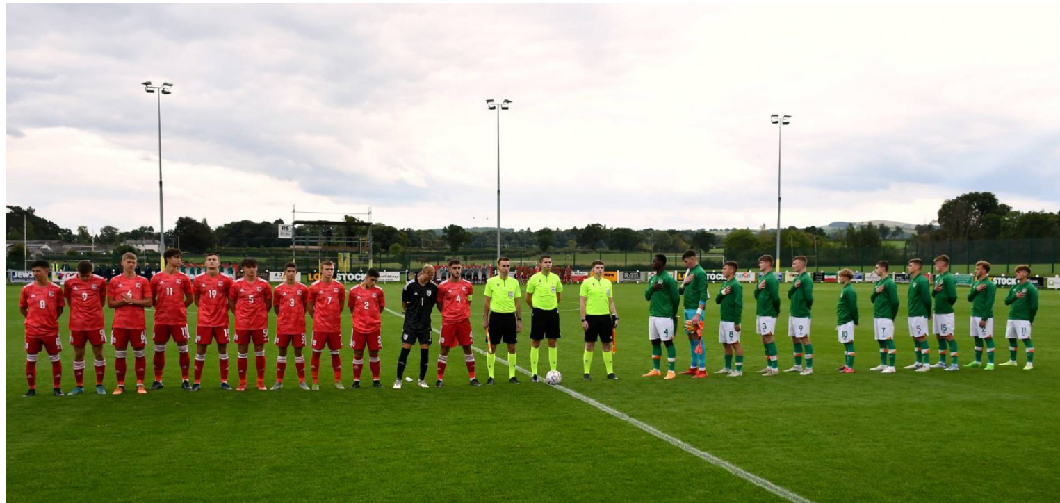
Ireland U19's V Gibraltar U19's

This structured and consistent approach enabled the club to build momentum , ultimately securing investment from a wide range of funders and progressing towards a multi-million-pound transformation.