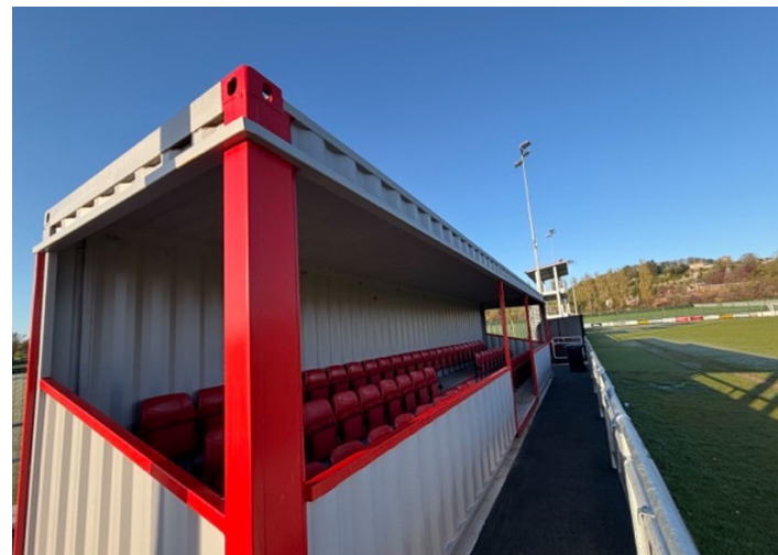
50 Seater Stands